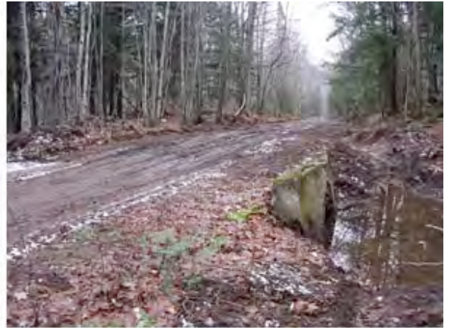
"Blind 35" today, a portion of the original M-35 route into the Huron Mountains from the southeast. The route is generally passable in most conditions.