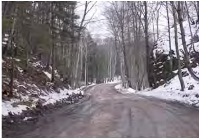
M-35 in the 1920s likely looked a lot like Co Rd 510 does day in this contemporary photo.

As ironic as it may seem, Henry Ford—the person who revolutionized the automotive industry and enabled the "common man" to afford his very own vehicle—actually helped halt a highway project in northwestern Marquette County in the Upper Peninsula of Michigan. In the end, the personal desire of one man, one very influential man, weighed more heavily than those of the public at large. But first, some background.