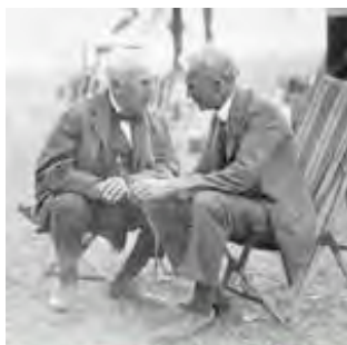
Henry Ford (right) and frequent travelling companion Thomas A. Edison.